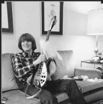
“BRING A SONG AND A SMILE FOR THE BANJO”