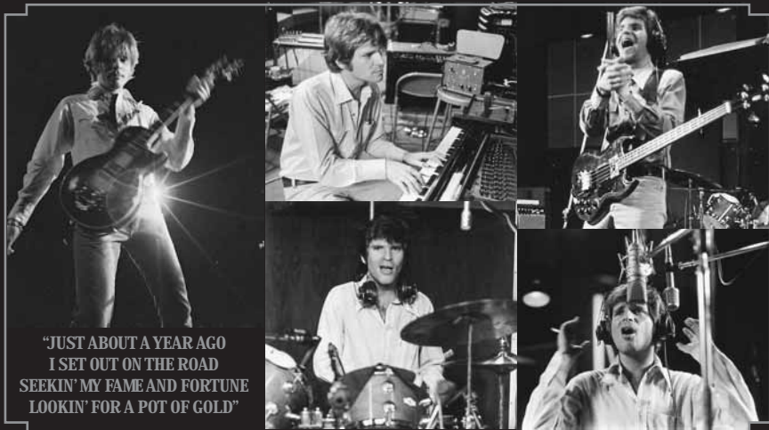
“JUST ABOUT A YEAR AGO I SET OUT ON THE ROAD SEEKIN’ MY FAME AND FORTUNE LOOKIN’ FOR A POT OF GOLD”