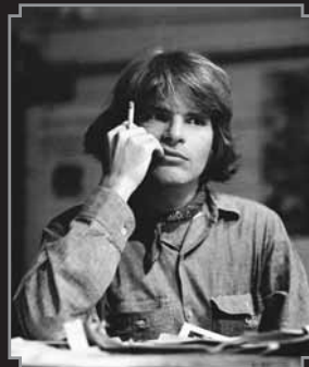
“I WANT TO KNOW, HAVE YOU EVER SEEN THE RAIN COMIN’ DOWN ON A SUNNY DAY?”