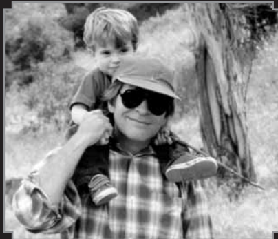
“NOW, WHEN I WAS JUST A LITTLE BOY STANDIN’ TO MY DADDY’S KNEE”